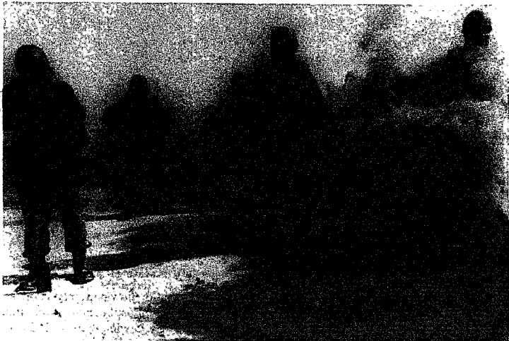
Army News Features

mediate result is a persistent muscular contraction, a state of cramp, followed by paralysis. And this is exactly what happens when the critical esterase, called acetylcholinesterase, becomes inhibited by a G-type phosphorous compound. When the block